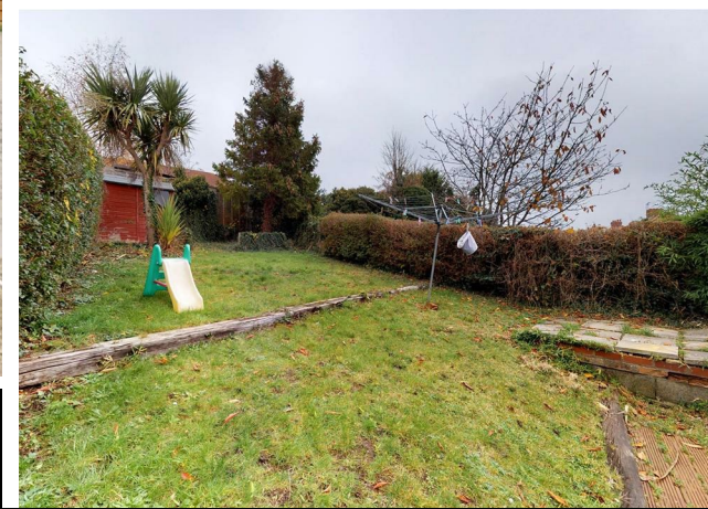
Ponsford Road, Knowle Park